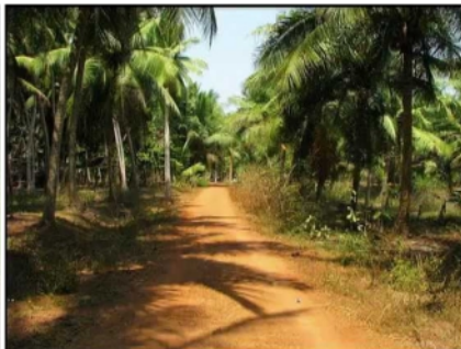
Flat muddy road