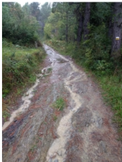
Steep muddy road

Q: 2 Given below are some types of roads commonly found in villages.